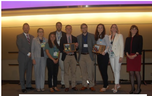
2017-18 WEAT River Cleanup Challenge Competition, Texas Water Awards Breakfast

Winners of the different award categories will be announced at the Texas Water Conference scheduled for April 2-5, 2019, in Houston, Texas. Photos and summaries of submissions will also feature in the Texas WET (the official magazine of WEAT).