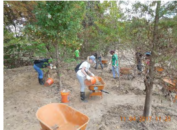
2017-18 WEAT River Cleanup Challenge Competition, Southeast Texas Section

Rivers are a major source of plastic and waste that eventually make their way into the ocean and other water sources. Current estimates show that between 1.15 and 2.41 million tons of plastic currently enter the ocean every year via rivers. Beach and river cleanups are a perfect way to have a direct impact on the quality of Texas rivers, lakes, and oceans. Being part of a cleanup event is also a great way to engage with your local community and have fun! On top of that, you and your group have the opportunity to be awarded and recognized at the Texas Water Conference Awards Breakfast. The conference will be held in Houston, TX on April 2-5, 2019.