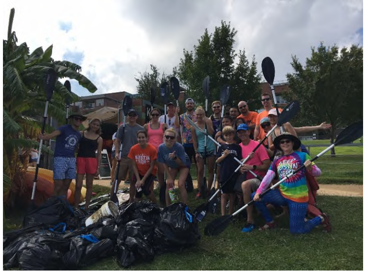
2016-2017 WEAT River Cleanup Challenge Competition, Central Texas Section