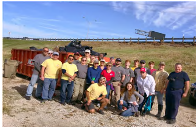
2017-18 WEAT River Cleanup Challenge Competition, North Texas Section

WEAT needs representatives from each WEAT section to organize cleanup events, gather the information from each event, and share it with the Clean Shores Challenge Workgroup. Each section representative organizes volunteers from their local sections and student chapters to plan, organize, coordinate and lead the event. Cleanup representatives are encouraged to collaborate with other community cleanup efforts or host their own event. Even better, the challenge is on your schedule! Entries will be judged based on challenge event(s) occurring between January 1 - December 31, 2018 . If you are interested in becoming a Cleanup representative for your section, please contact the Workgroup.