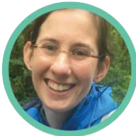
Cat Gowan King County, WA