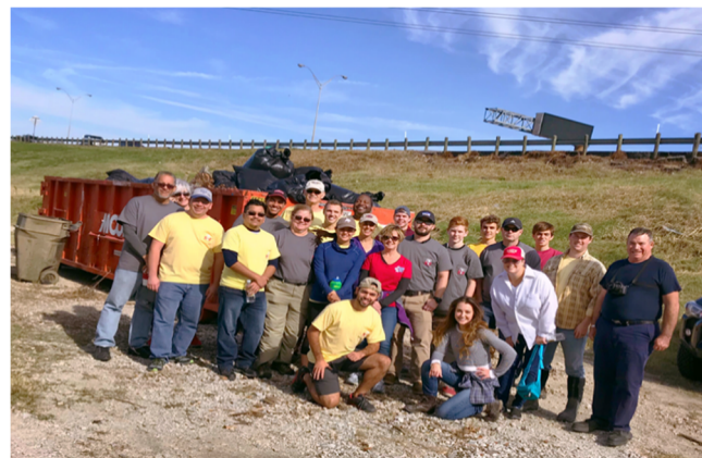
2017-18 WEAT River Cleanup Challenge Competition, North Texas Section

WEAT needs representatives from each WEAT section to organize cleanup events, gather the information from each event, and share it with the Clean Shores Challenge Workgroup. Each section representative organizes volunteers from their local sections and student chapters to plan, organize, coordinate and lead the event. Cleanup representatives are encouraged to collaborate with other community cleanup efforts or host their own event. Even better, the challenge is on your schedule! Entries will be judged based on challenge event(s) occurring between January 1 - December 31, 2019 . If you are interested in becoming a Cleanup representative for your section, please contact the Workgroup.