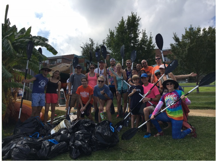
Central Texas Section