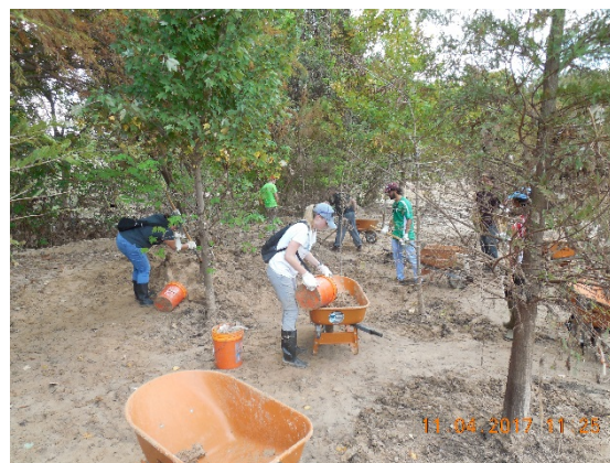
2017-18 WEAT River Cleanup Challenge Competition, Southeast Texas Section

Rivers are a major source of plastic and waste that eventually make their way into the ocean and other water sources. Current estimates show that between 1.15 and 2.41 million tons of plastic currently enter the ocean every year via rivers. Beach and river cleanups are a perfect way to have a direct impact on the quality of Texas rivers, lakes, and oceans. Being part of a cleanup event is also a great way to engage with your local community and have fun! On top of that, you and your group have the opportunity to be awarded and recognized at the Texas Water Conference Awards Ceremony. The conference will be held in Fort Worth, TX on March 31- April 3, 2020.