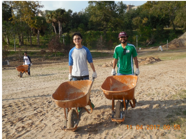
2017-18 WEAT River Cleanup Challenge Competition, Southeast Texas Section

Provide a little something to the volunteers who participate. Remember that they are giving their time, and they deserve to be appreciated! A T-shirt usually does the trick, but providing a good meal for after the work is done will keep morale high, encourage comradery, and also provide a bit of motivation to get things done!